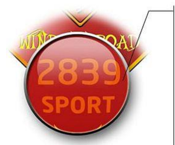
Check the KODE of the patterns for quick reference